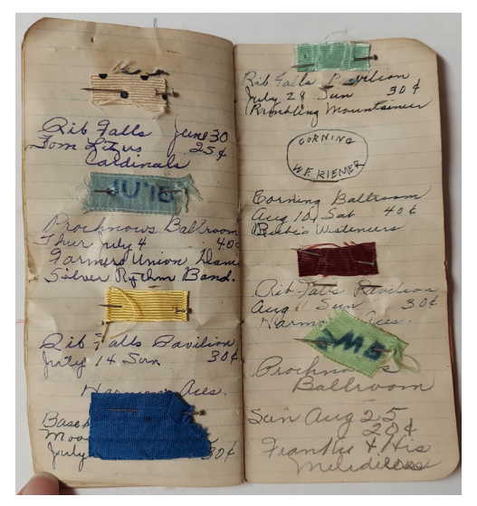
3 spreads from the booklet with details of the dance and the ribbon pinned to the page.