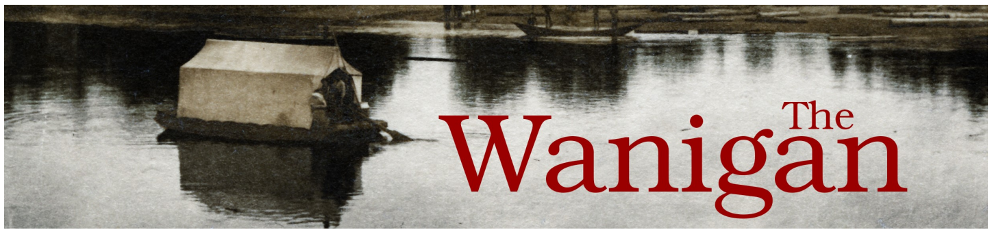
THE NEWSLETTER OF THE MARATHON COUNTY HISTORICAL SOCIETY • 2021 No. 2