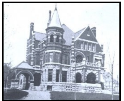
The Plumer House

During Historic Preservation Month, we typically celebrate properties that have been saved from demolition. Too many homes and buildings have been lost to the wrecking ball and, in most cases, no physical reminders of these structures remain. As a historical society we strive to preserve important artifacts from the past, and sometimes this includes architectural remnants.